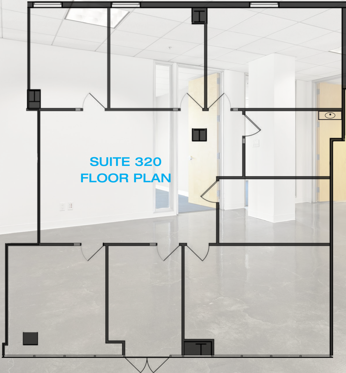
SUITE 320 FLOOR PLAN

MEDICAL OFFICE SPACE | $3.30 PSF, FSG | 2,601 SQFT