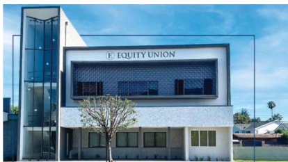
Building: Equity Union's Toluca Lake location.