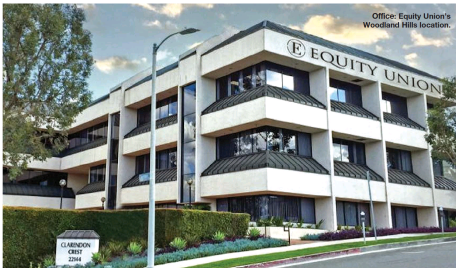
Office: Equity Union's Woodland Hills location.